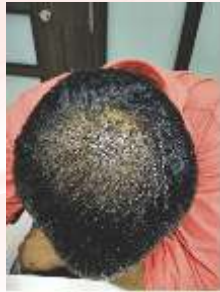
After (2 Months)